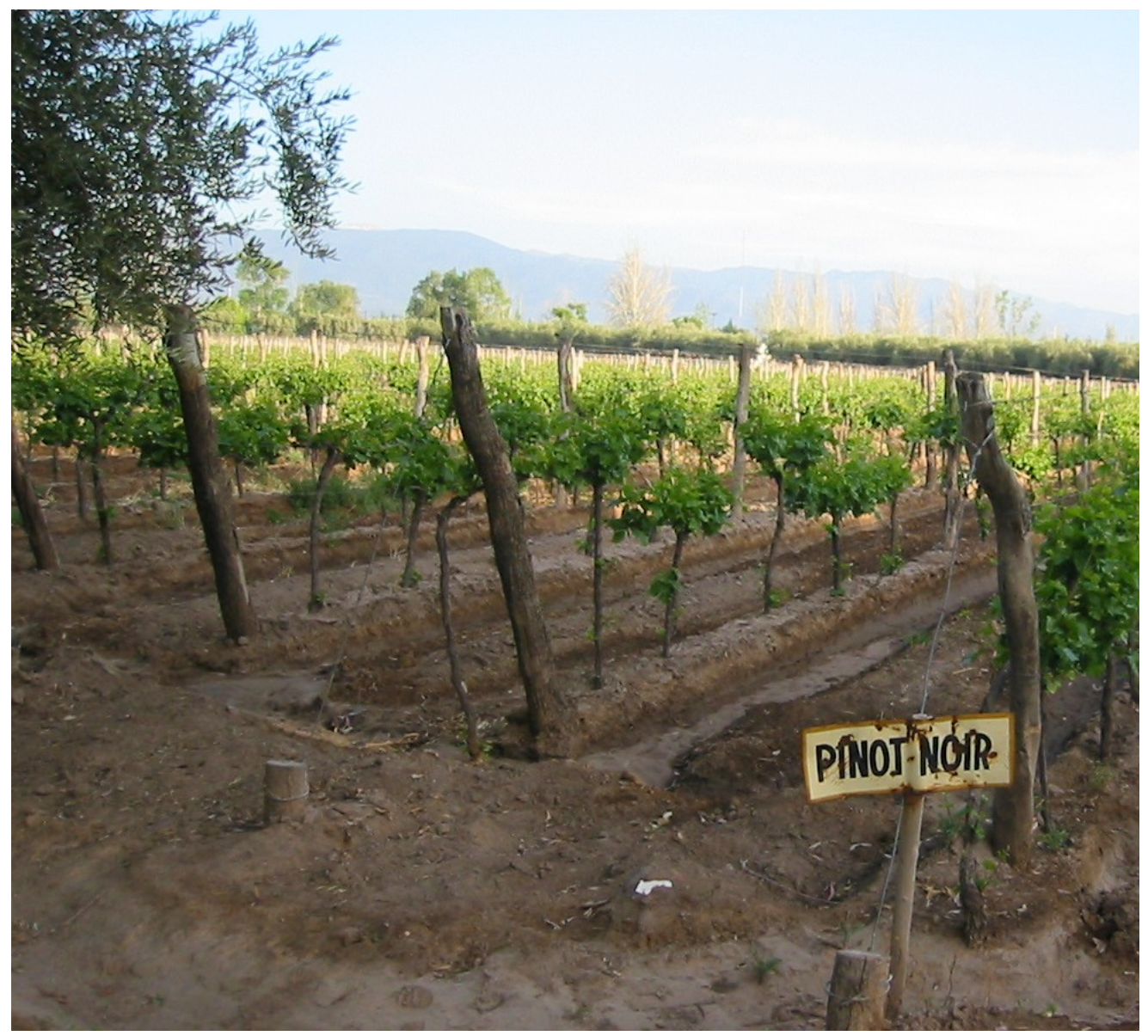
Our tastings show that Argentina is no longer only a malbec country.