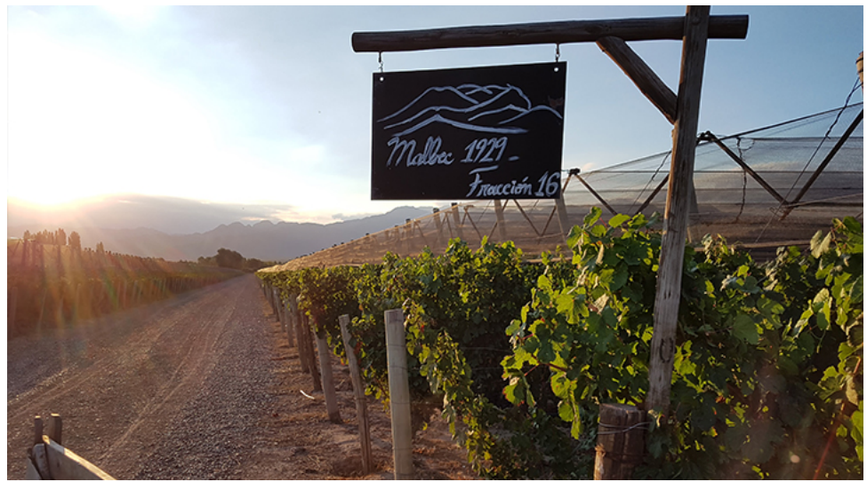
Las Compuertas was the first region in Argentina to be officially recognized as an appellation in 1993.

"I also think as we pick earlier, which could be a bit dangerous as you might have some green or tannic wine, but for us, the climatic conditions are helpful as the sunlight is very intense. Our vineyard is old and most importantly ungrafted, which is why I think picking early does not give us a hard and green wine, but instead, captures the energy that it is still pushing up the sap," said Incisa della Rocchetta, before reiterating that nothing he said was utterly true but more of a collection of observations and experience – possibly the only truth in winemaking.